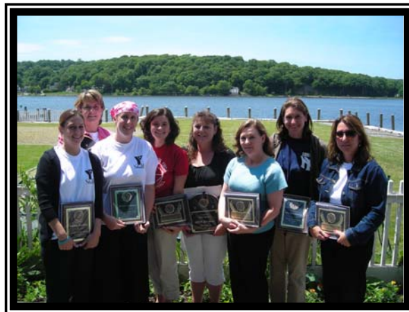
2007 Chapter 3 Award Winners!

Procedures, description of awards/recognitions, and an official nomination form are included in this packet. Please give serious consideration to recognize the service or achievement of someone you work with or someone you know who is doing an outstanding job.